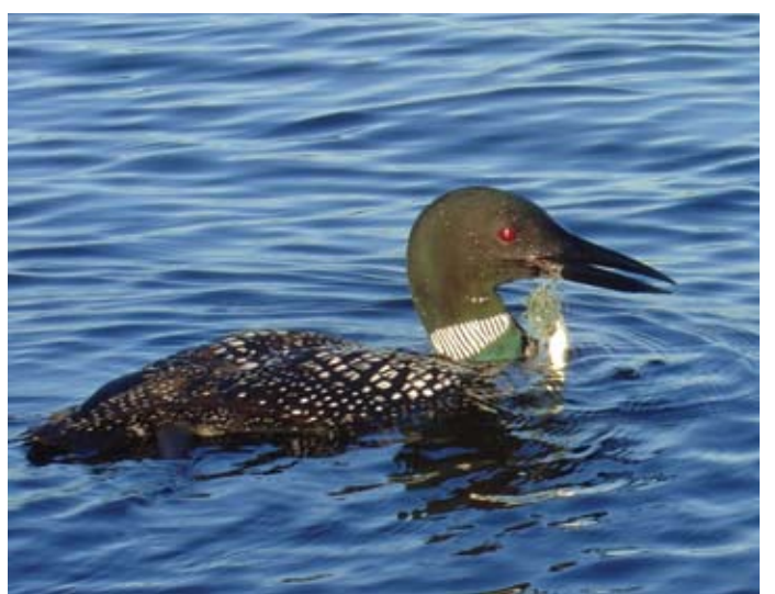
A COMMON LOON ENTANGLED IN FISHING LINE.

Despite a wet summer and an unfortunate increase of loon entanglement in fishing line, Vermont's loon population thrived in 2009, setting a modern record with 66 nesting pairs and 74 chicks surviving through August. At least 7 of Vermont's 228 adult loons either took live bait or lures, or became snagged in discarded or broken-off fishing gear. One of these birds was found dead on Lake Champlain in South Hero, while 2 were captured and released on Neal Pond in Lunenberg and Lake Willoughby. The outcome of the other entangled loons is uncertain. The Vermont Loon Recovery Project (VLRP) urges anglers to reel in when loons are diving nearby, and to retrieve and dispose of broken line. Attempts to catch a free-swimming loon with fishing line around its head are rarely successful and require much time and expense.