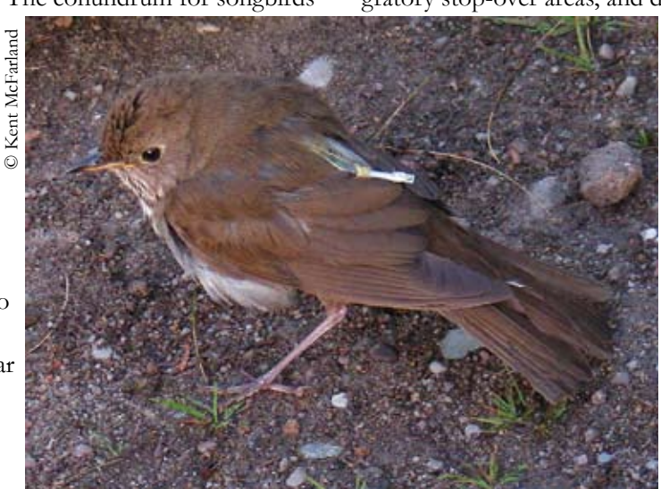
A BICKNELL'S THRUSH WEARING A "BACKPACK" SOLAR GEOLOCATOR.

Enter Canadian ecologist Bridget Stutchbury. Two years ago she attached solar geolocators—miniature, light-sensitive devices, each weighing less than a dime—to a handful of Purple Martins and Wood Thrushes. One year later, the data she retrieved at her Pennsylvania study site yielded the first clear picture of individual songbird migration routes and over-wintering