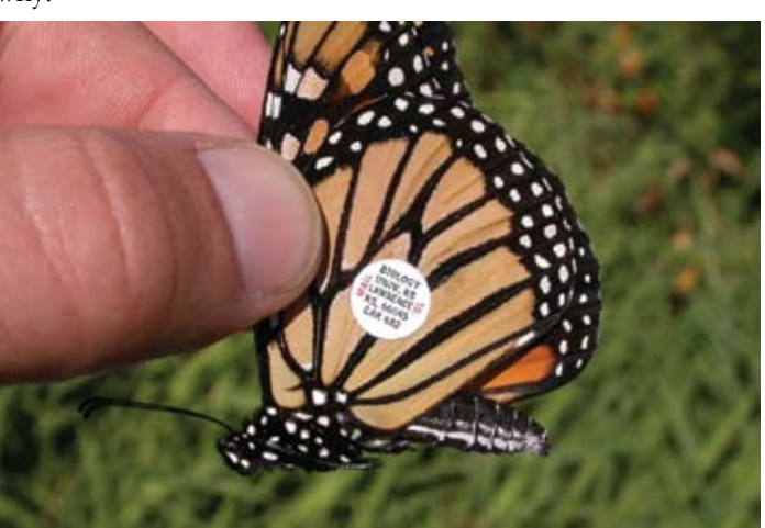
A TAGGED MONARCH READY FOR RELEASE. SEVEN MONARCHS TAGGED IN VERMONT HAVE BEEN FOUND IN MEXICO.

Hey, where did all the Monarchs go? That question was on many peoples' minds this fall. By many accounts, 2009 was a disappointing year for Monarch enthusiasts, and several of us are wondering...well...where DID all the Monarchs go? Was there as dramatic a decline in numbers as it seemed, and if so, why?