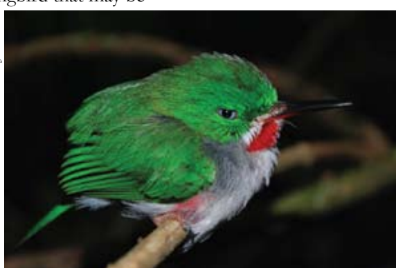
A NARROW-BILLED TODY, ONE OF THE ENDEMIC SPECIES THAT STANDS TO BENEFIT FROM HABITAT CONSERVATION EFFORTS.