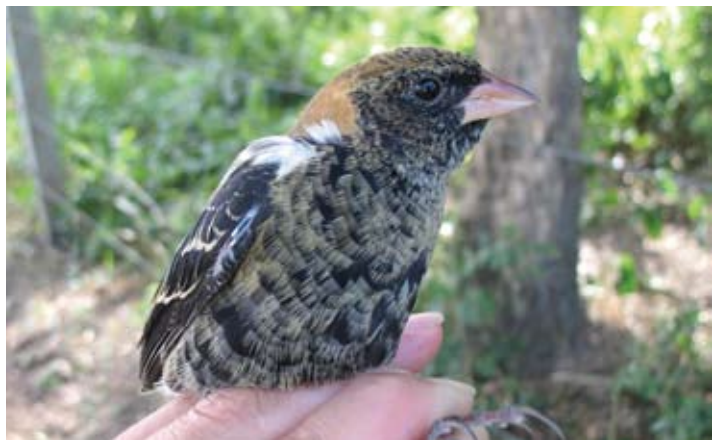
A MALE BOBOLINK IN BREEDING PLUMAGE AFTER BEING BANDED IN BOLIVIA.

Then, on June 15, 2009, three and a half years after he'd been banded, Bobolink No. 0961-10071 turned up in Chelsea, VT,