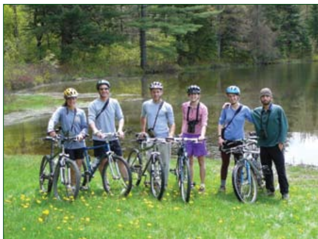
BIRDATHON CREW 2006

Each spring, we celebrate the return of birds from the tropics to the tundra by spending a day counting them on foot and by bike. This year's Birdathon incorporates a new twist—we will join efforts with Four Winds Nature Institute and the North Branch Nature Center to count birds, plants, insects, and other groups of organisms throughout Vermont. "Birdathon & Beyond" will take place on Saturday, May 17th.