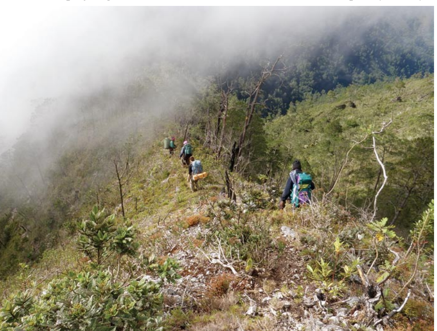
AFTER FOUR DAYS OF RUGGED HIKING, THE FIELD CREW FINALLY REACHED THE SUMMIT OF PIC MACAYA. DESPITE THIS REMOTENESS, MEN CARRYING PINE BOARDS ARE OFTEN ENCOUNTERED.

ment at La Visite we found several aggregations which we estimated contained dozens of calling birds. Especially worrisome at La Visite was the rapid forest clearing for agriculture that has reduced available habitat to a small and fragmented broadleaf forest that now covers less than 240 hectares (about 600 acres). At Loma del Toro we found only a handful of scattered birds, although thankfully the site is reasonably well-protected inside Sierra de Bahoruco National Park. That left Macaya Biosphere Reserve as the last unknown, as the area had not been adequately surveyed since the 1980s. Maca-