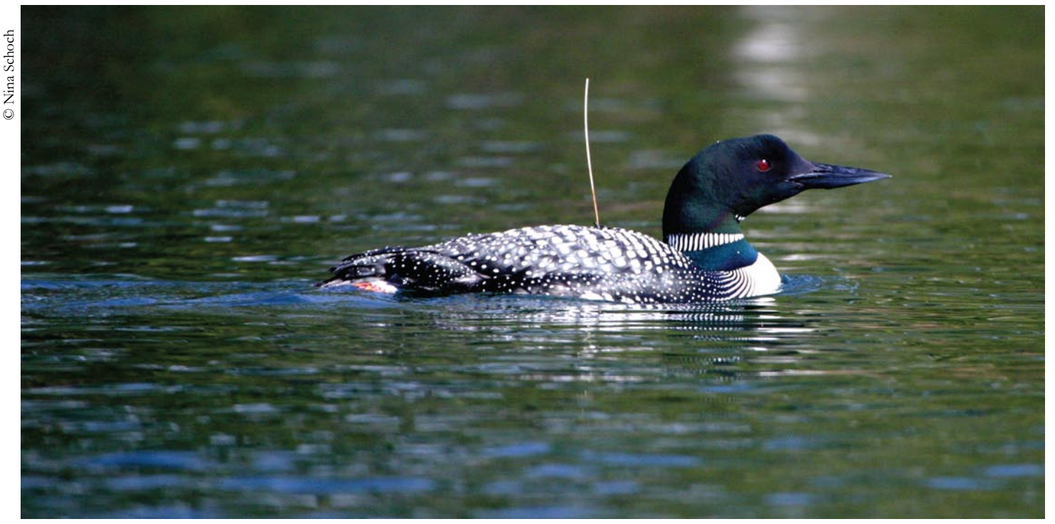
RECENT STUDIES USING SATELLITE RADIO TRANSMITTERS HAVE REVEALED THAT COMMON LOONS, SUCH AS THIS ONE IN THE ADIRONDACKS, SPEND THE WINTER FURTHER NORTH THAN EXPECTED. MOST RADIO-TAGGED LOONS FROM NEW HAMPSHIRE AND MAINE OVERWINTERED OFF SHORE BETWEEN MAINE AND CAPE COD.