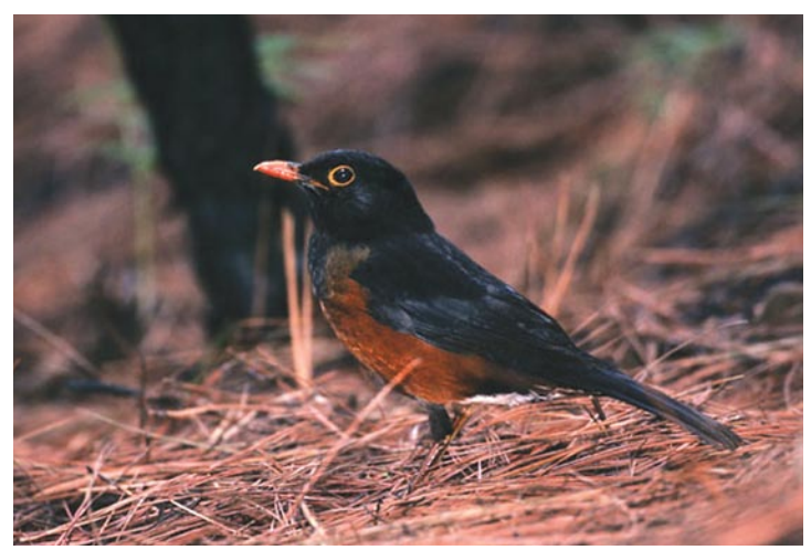
FOUND NOWHERE ELSE IN THE WORLD, THE LA SELLE THRUSH IS ONE OF HISPANIOLA'S RAREST BIRDS AND A TOP CONSERVATION PRIORITY.

and pine forests harbor no fewer than 21 of Hispaniola's 31 recognized endemic bird species-9 or 10 of these are found in no other habitat types. Several, including La Selle Thrush, Western Chat-Tanager, and Hispaniolan Crossbill, rank among the Caribbean's most rare, at-risk species. The Blackcapped Petrel, a small pelagic 'tubenose', may number fewer