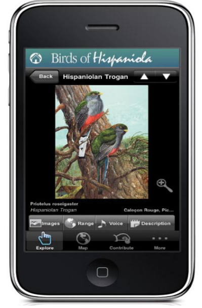
AN IPHONE DISPLAYING THE NATIONAL BIRD OF HAITI, ONE OF 58 ENDEMIC BIRDS FEATURED IN THE NEW APP, WHICH RAISES FUNDS FOR EARTHQUAKE RELIEF IN HAITI.