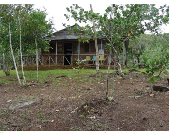
THE CASETA WITH WRAPAROUND PORCH IN LOMA GUACONEJO, DOMINICAN REPUBLIC.

After finishing my breakfast I enter the caseta, a simple wooden shelter with smooth concrete floors, electricity