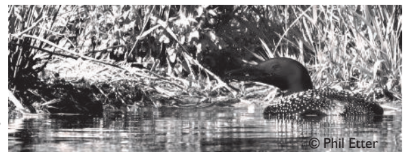
Off the nest cooling down.

figuring out how to assess loons’ prey base may hold part of the key to explaining how loons and climate interact here, at the southern edge of the species’ range. ***