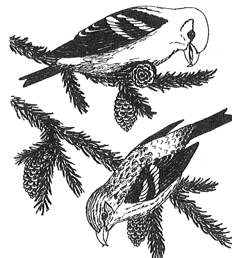
MARTIN WHITE-WINGED CROSSBILL