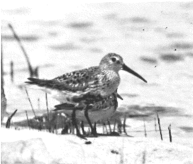
Normally a fall migrant in Vermont, this Dunlin was found on May 28, 1998 at Simm's Point on Grand Isle.