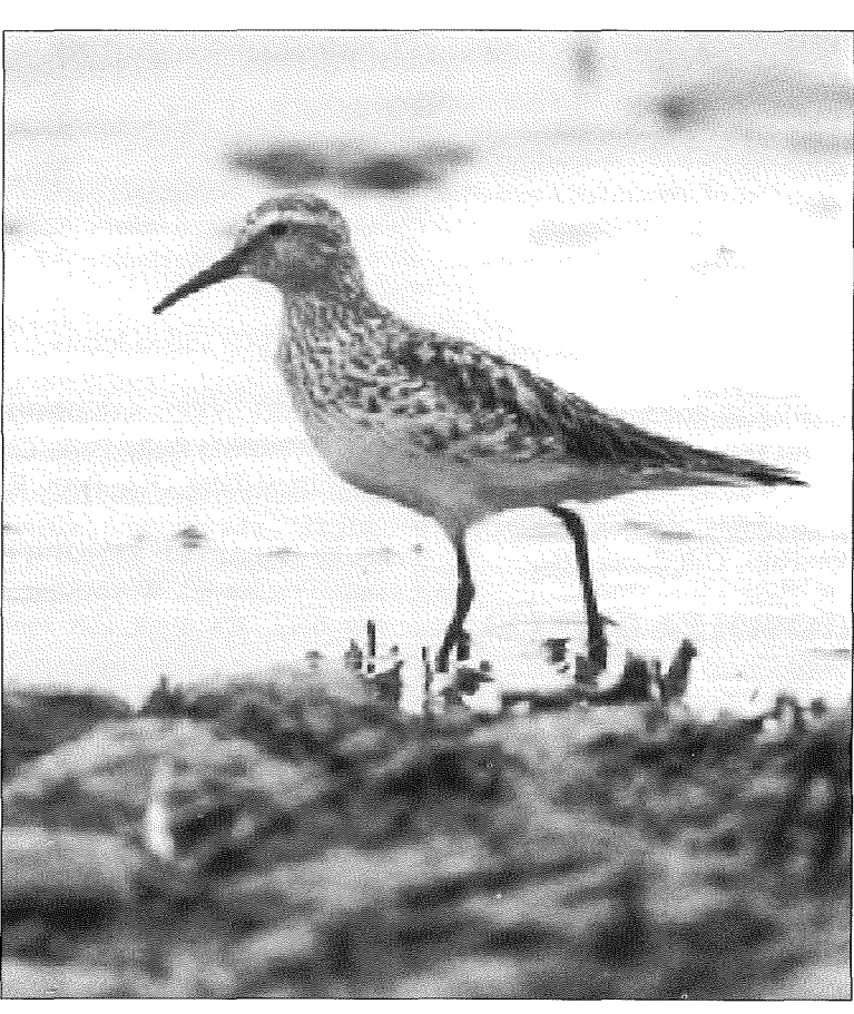
This White-rumped Sandpiper was observed and photographed by David Hoag on 1 June, 1999 in Grand Isle, VT.

(Sterna caspia) - six or seven, north Lake Champlain, various towns and dates, 22 July 1999 thru 4 September 1999. R.B. Lavallee et al. Tabled pending receipt of reports from other observers or photographs.