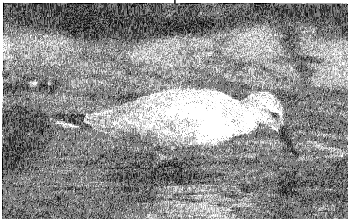
On September 4, 2000 this Red Knot appeared on Young Island, Grand Isle Vermont.