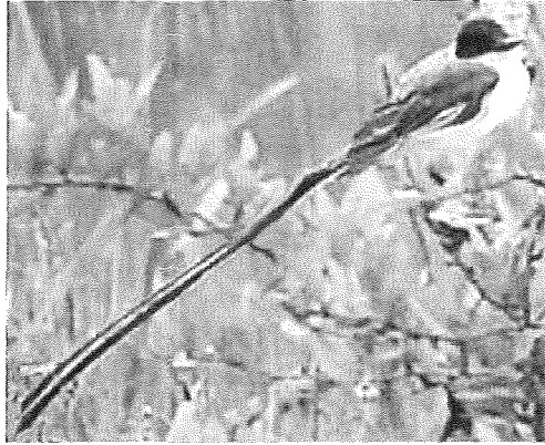
Fork-tailed Flycatcher

The Vermont Bird Records Committee met on November 4, 2000, for its annual review of rare bird reports. The Committee's responsibilities are to establish guidelines for the documentation of rare birds, and to review reports for inclusion in the state bird list and for use by researchers. The Committee's recommendations are reported in the publication Records of Vermont Birds (RVB). The Bird Records Committee