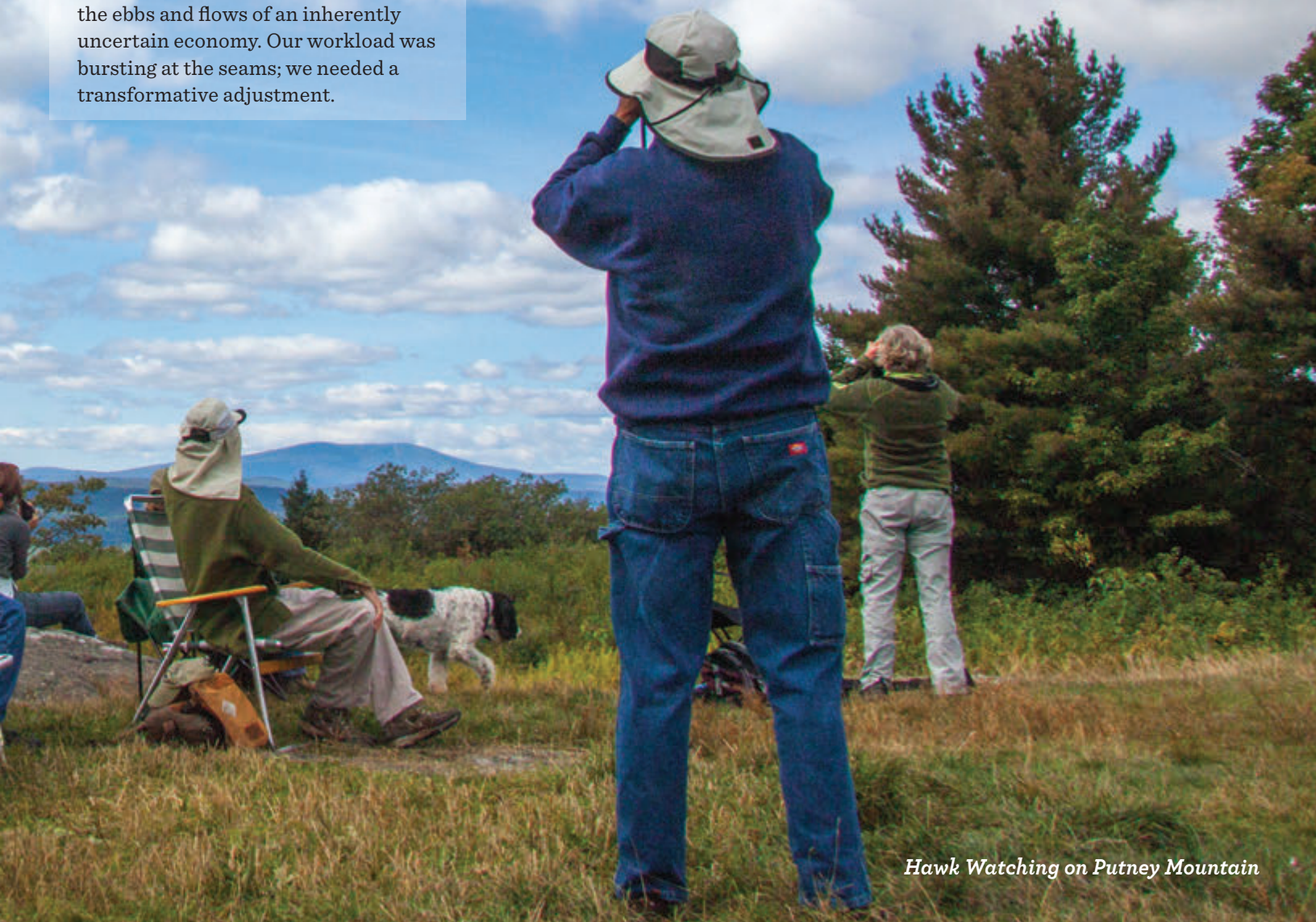
Hawk Watching on Putney Mountain

2014 brought key structural changes to VCE, enabling the growth and maturation that we envisioned in our 2012-2016 strategic plan.