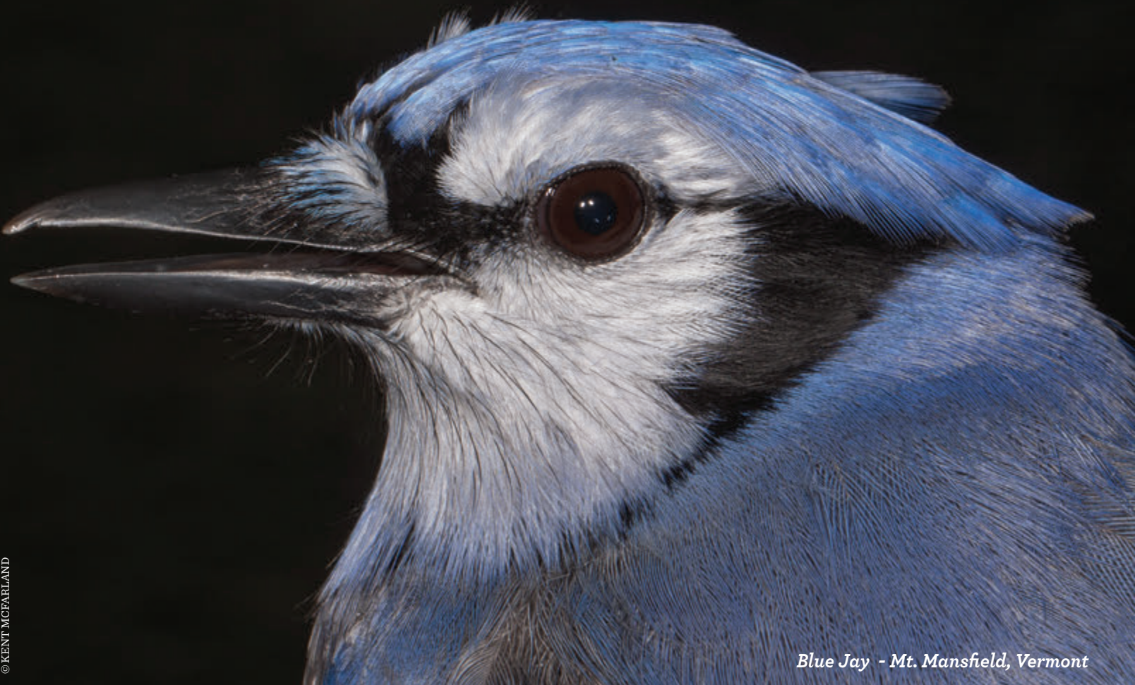
Blue Jay - Mt. Mansfield, Vermont

THE VERMONT CENTER FOR ECOSTUDIES ADVANCES THE CONSERVATION OF WILDLIFE ACROSS THE AMERICAS THROUGH RESEARCH, MONITORING AND CITIZEN ENGAGEMENT.