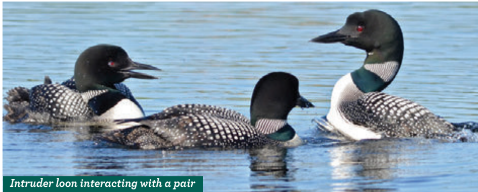
Intruder loon interacting with a pair