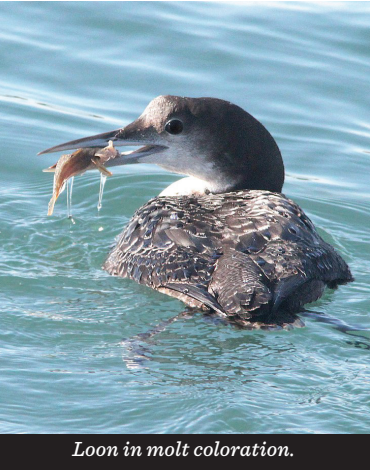
Loon in molt coloration.

November — April: Vermont loons migrate to ocean wintering grounds mainly off the New England coast. Adults undergo a feather molt in late fall, taking on a coloration similar to that of a full grown juvenile (gray/white).