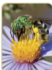
Bees and wasps