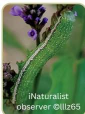
Verbena moth ( Crambodes talidiformis ) caterpillar