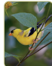
Seed eating Songbirds