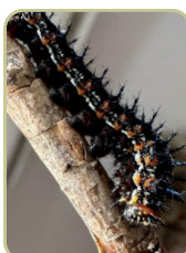
Common Buckeye ( Junonia coenia ) caterpillar