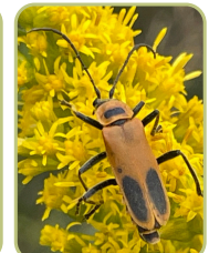
Beetles, flies, and other insects