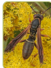
Bees and wasps