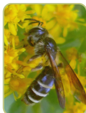
Cloudy-winged Miner Bee ( Andrena nubecula )