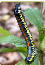
Brown-hooded Owllet Moth ( Cucullia convexipennis ) caterpillar