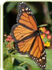
Butterflies and moths