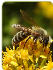
Hairy Banded Miner Bee ( Andrena hirticincta )