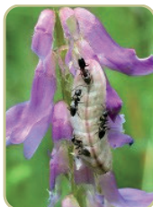
Eastern Tailed-blue ( Cupido comyntas ) caterpillars