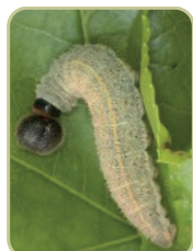
Silver-spotted Skipper ( Epargyreus clarus ) caterpillars