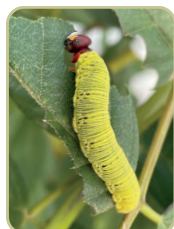
Hoary Edge Skipper ( Achalarus lyciades ) caterpillars