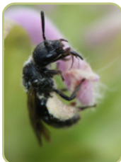
Beebalm Shortface Bee ( Dufourea monardae )