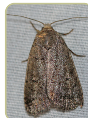
The Slowpoke Moth ( Athetis tarda ) caterpillar