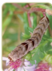
Hitched Arches Moth ( Melanchra adjuncta ) caterpillar