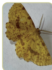
Crocus Geometer Moth ( Xanthotype sospeta ) caterpillar