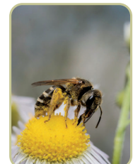
Bees and other insects